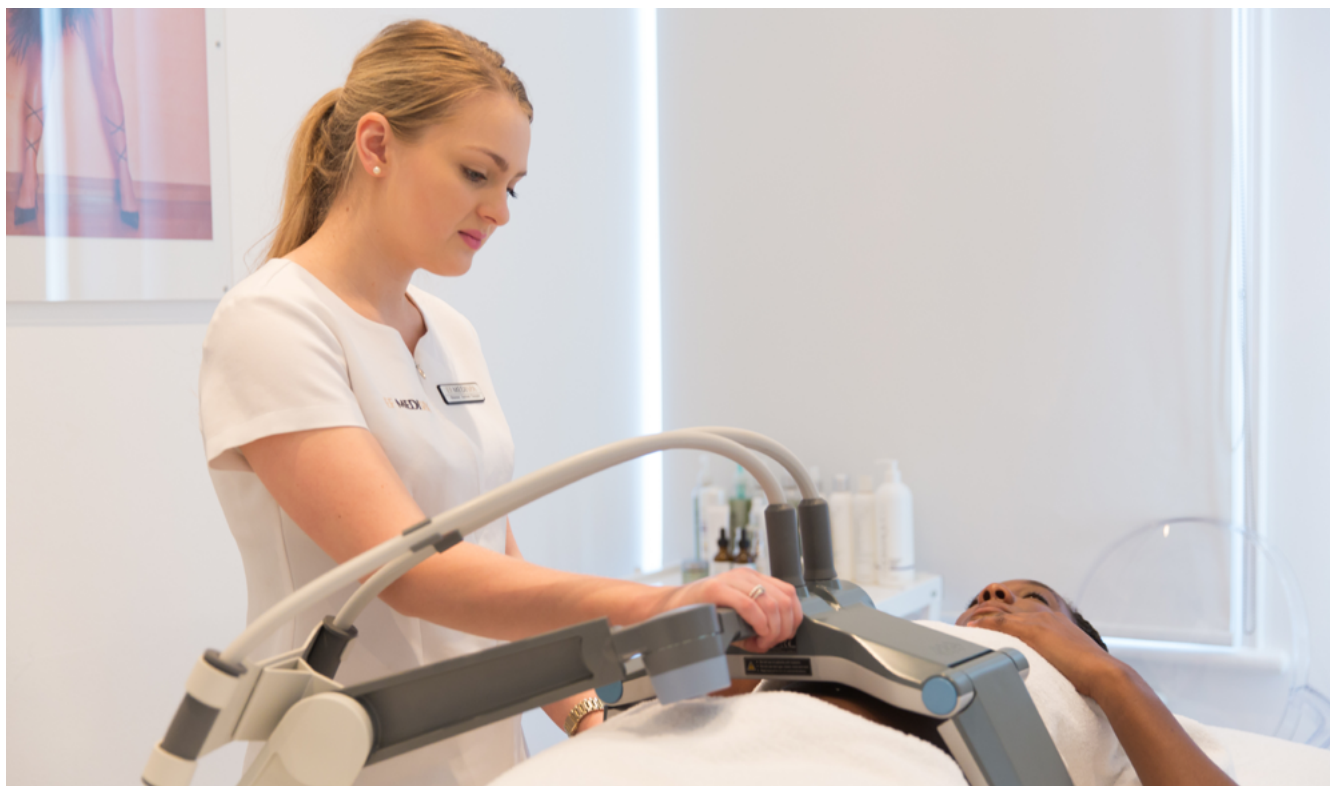
Reduce by Vanquish

Reduce by Vanquish , a pain-free, permanent fat reduction and inch loss treatment with zero downtime.